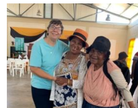
The elderly receiving Christmas shoeboxes